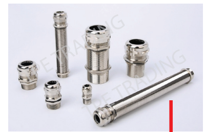
Can add more Thread Length (GL) - Optional*