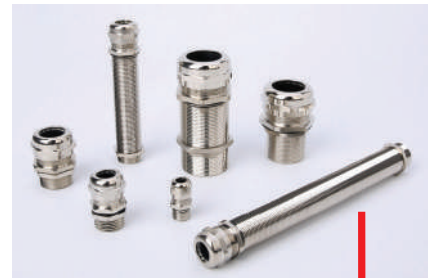
Can add more Thread Length (GL) - Optional*